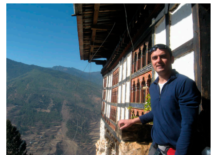
A detour to Bhutan on a recent trip to India.