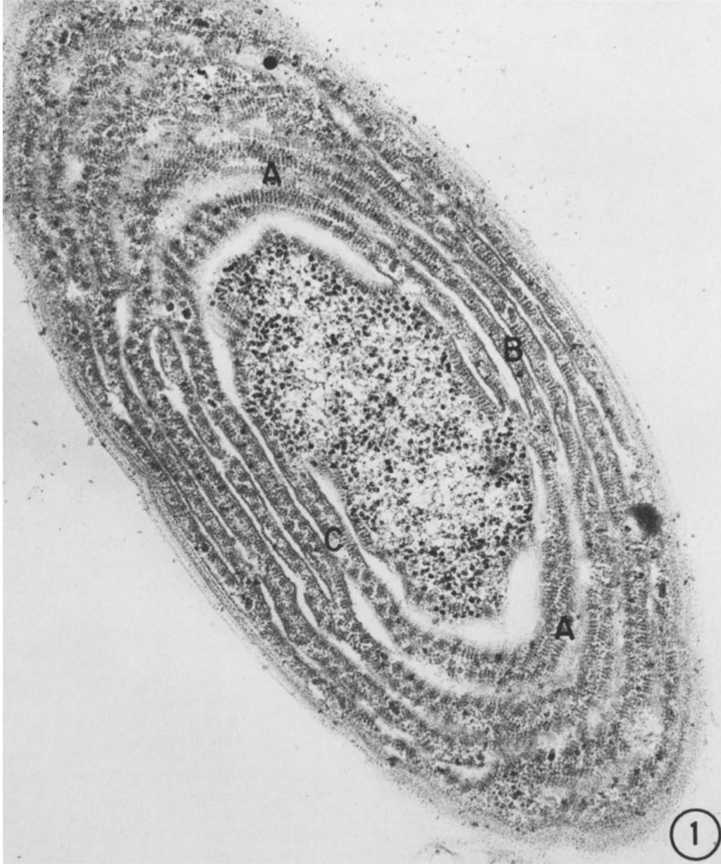
FIGURE 1 This slightly oblique section of the thermophilic blue-green alga Synechococcus lividus displays various planes of section of the concentrically arranged photosynthetic lamellae and of the phycobilisomes attached to them. In grazing sections (A), the phycobilisomes appear as short dense lines. They have a similar appearance in longitudinal section (B), except that their attachment to the lamellae is visible. In cross-section (C), they have a broad rounded face. \times 60,000 .

side of each photosynthetic lamella. The distance from the center of one row of phycobilisomes to that of the adjacent row is 400–500 Å. The shape of the phycobilisomes depends on the plane of section from which they are viewed. Three planes