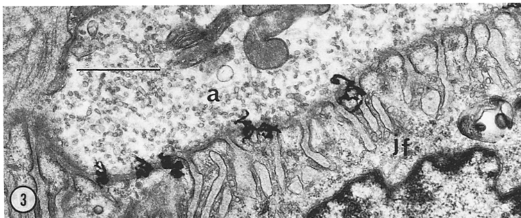
FIGURE 3 EM autoradiogram showing [ ^{125} I] \alpha -BTX label 8 days after binding at the neuromuscular junction of mouse sternomastoid muscle. The residual label is not distributed over the full depth of the junctional folds ( jf ) but is primarily concentrated in a zone at the top of the folds adjacent to the axon ( a ), and thus similar to that seen immediately after incubation with [ ^{125} I] \alpha -BTX (5). \times 21,500 .

Acetylcholine receptors were inactivated in vivo at the mouse neuromuscular junction using \alpha -bungarotoxin ( \alpha -BTX). It was found that neurally