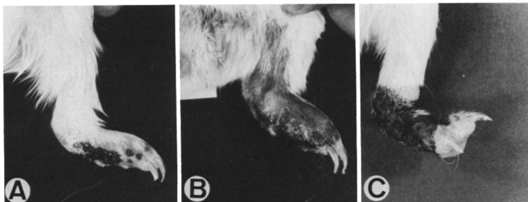
FIGURE 1. Heat-killed tubercle bacilli (100 \mu g) in water-oil emulsion were injected into the footpads of guinea pigs as the preparatory injection. 4 wk later, the provocative injection was made intracutaneously at the flank with 100 \mu g MDP in PBS. These photographs show the state of the footpads (A) immediately before, (B) 24 h after, and (C) 30 d after the provocative injections of MDP.

Guinea pigs given the preparatory and provocative injections also showed, before the development of the conspicuous footpad necrotic reaction, a consistent and reproducible set of general symptoms. The guinea pigs became lethargic and anorexic, and huddled together. Their body weights decreased (Table I)