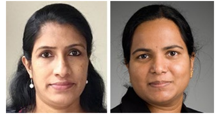
Insight from Teneema Kuriakose and Thirumala-Devi Kanneganti

To delineate the upstream and downstream components involved in cGAMP-mediated inflammasome activation, Swanson et al. (2017) probed the role of DNA sensor cGAS and the adaptor STING. Transfection of dsDNA an-