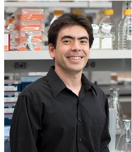
Insight from Ken Cadwell.

Another unexpected observation came from analysis of mice with heterozygous deletion of these susceptibility genes.