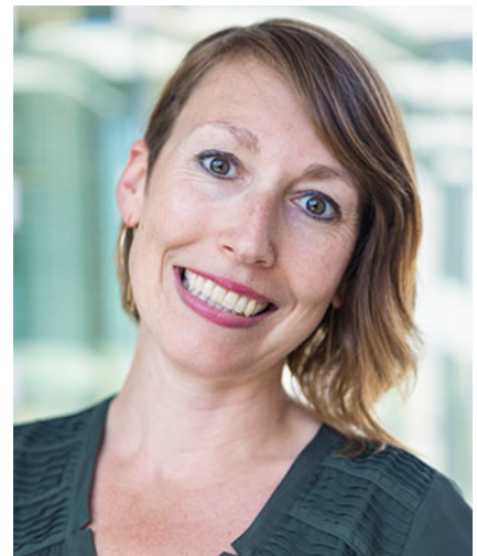
Insights from Anna Beaudin.

30% of Ccnd2 Vav mice developed spontaneous tumors that shared many overlapping phenotypic and genotypic features of classic human MCL, including expression of CD5 and Sox11. Still, the latency to spontaneous